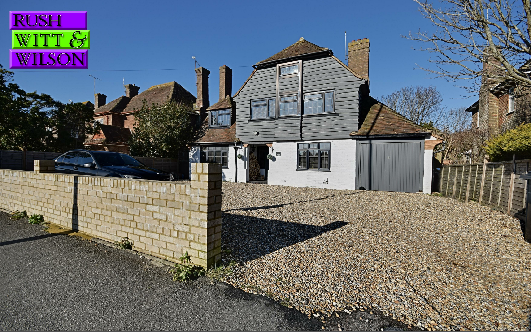
214 Cooden Drive, Bexhill-On-Sea, East Sussex TN39 3AG £595,000